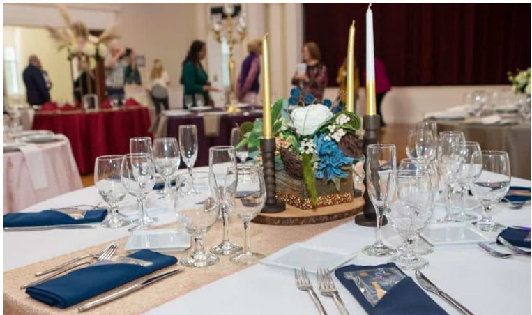
Gleb Budilovsky Photography