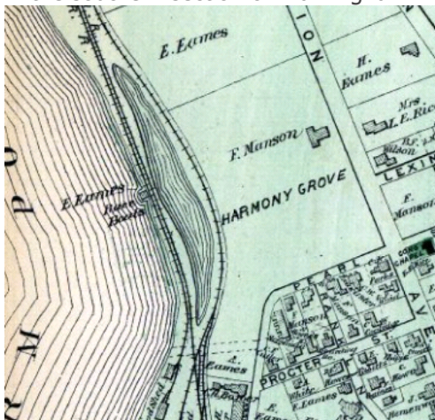
Harmony Grove located between Farm Pond and Union Avenue.

Henry David Thoreau described Harmony Grove in his Lecture 43 , "Harmony Grove was located on the shores of Farm Pond in the southern section of Framingham.