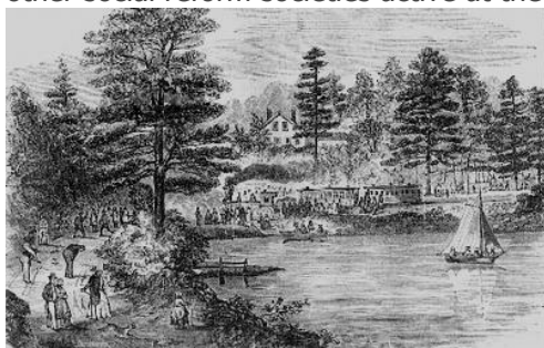
Harmony Grove, 1852

It had boating facilities and areas for strolling, for playing games, and for holding large outdoor meetings-a combination making it a popular spot for gatherings of temperance, abolition, and other social reform societies active at the