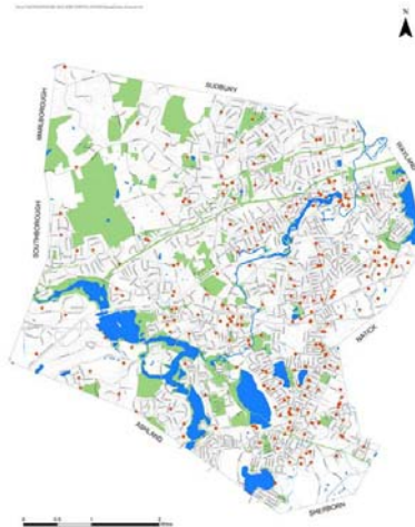
Creative Economy Businesses in Framingham Prepared by the Division of Community & Economic Development January 2017

More than 30 artists, businesses, and nonprofits come together to discuss Town's creative scene